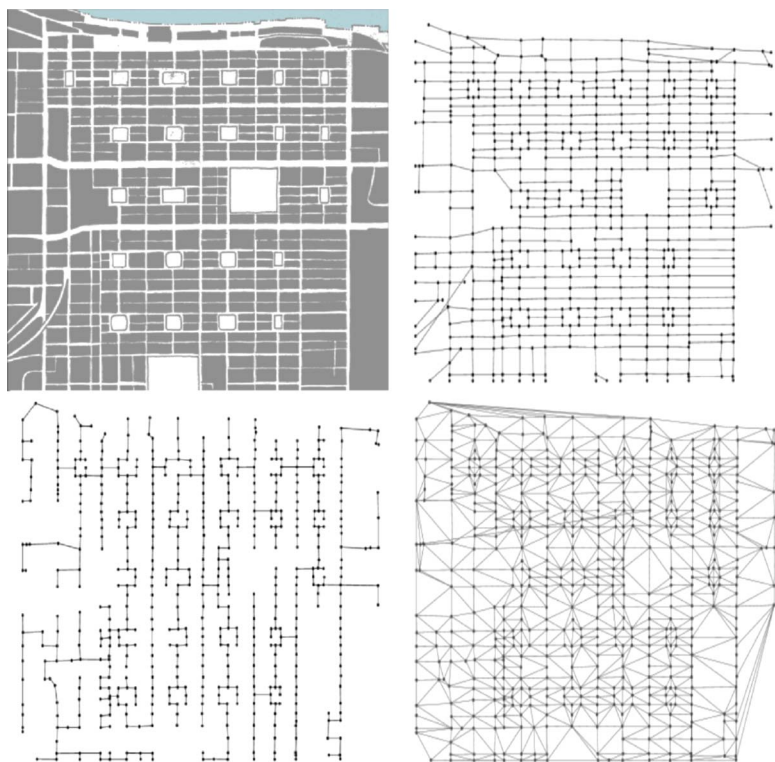
FIG. 1. (Color online) The urban pattern of Savannah as it appears in the original map (top left), and reduced into a spatial graph (top right). We also report the corresponding MST (bottom left) and GT (bottom right) [32].